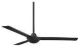
Minka-Aire Large Room Fan (52" to 59") MF833BK Black