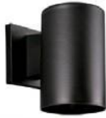
Progress Outdoor Entrance Wall Light PP571231 Black

Depiction of colors and choices are for general illustration purposes only, as print or screen pictures are not true to actual colors. We recommend reviewing the product samples provided by the builder for a truer understanding of the product color and finish. The color of natural and man-made products will vary from one batch to another and color match is not guaranteed. All products, selections, and finishes are subject to availability and builder reserves the right to make changes or offer alternate selections if necessary.