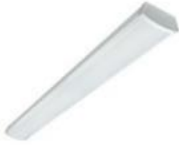
Nuvo Lighting Flush Mount Ceiling Light N651084 White