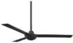
Minka-Aire Large Room Fan (52" to 59") MFB33BK Black